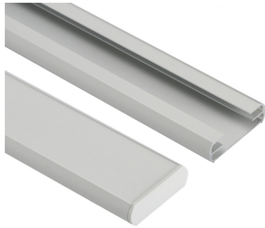
Honeycomb Bar #56