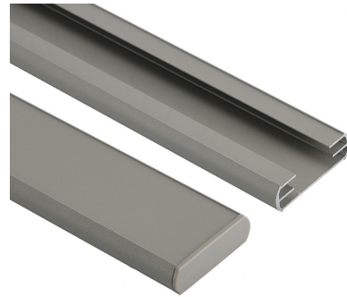
Honeycomb Bar #56