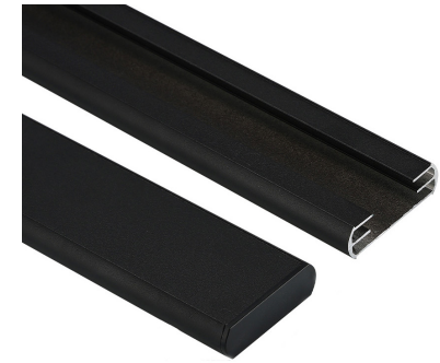
Honeycomb Bar #56

Colour: Titanium Height: 12mm Width: 45mm