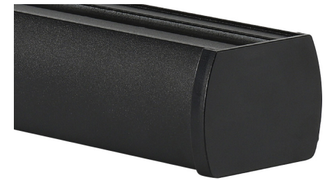
Honeycomb Box #18

Colour: Titanium Height: 99mm Width: 50mm