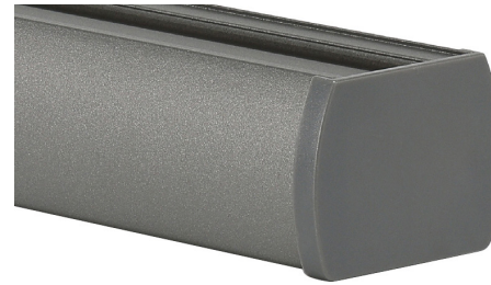
Honeycomb Box #18

Colour: Titanium Height: 99mm Width: 50mm