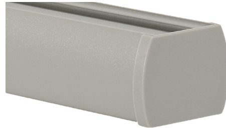
Honeycomb Box #18