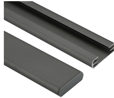
Honeycomb Bar #56

Colour: Titanium Height: 12mm Width: 45mm